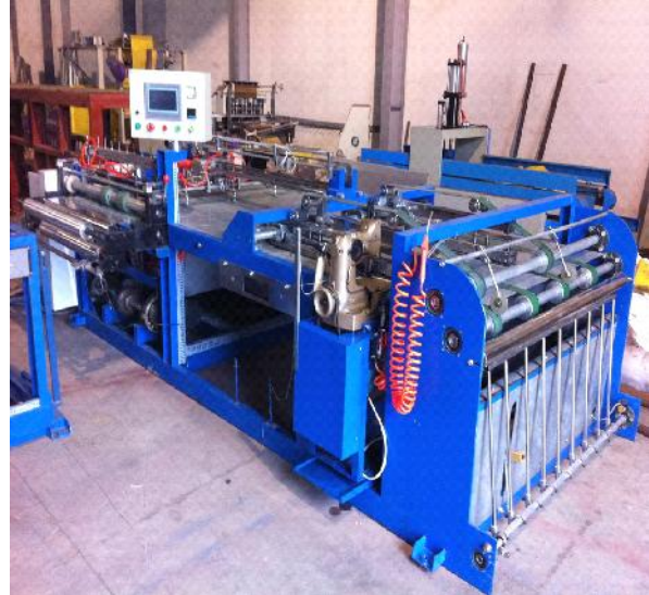
nearly finished machine